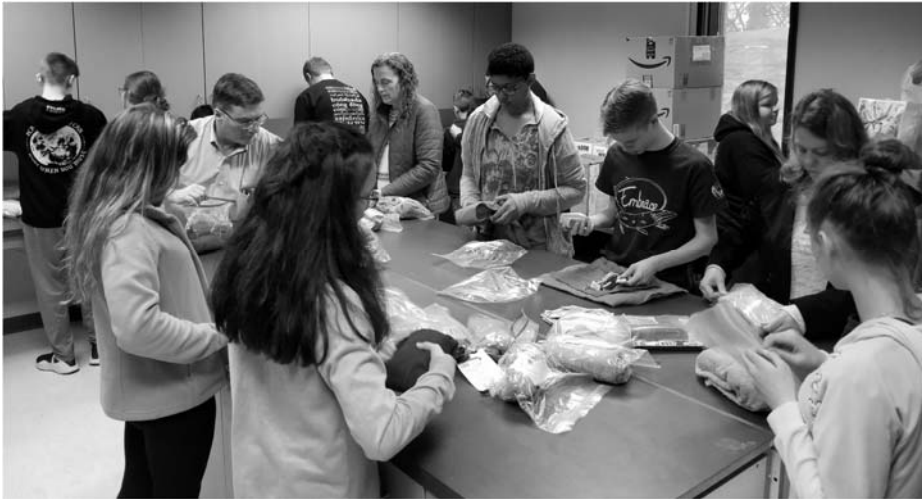
Pictured are youth who attended the OUTWARD Retreat assembling flood buckets as part of their fun-packed, mission-driven weekend of fellowship. Consider gathering up youth from churches in your area to assemble UMCOR kits.

Relief (UMCOR) is the humanitarian relief and development arm of The United Methodist Church (UMC). The purpose of UMCOR is to assist United Methodists and churches to become involved globally in direct ministry to persons in need through programs of relief, rehabilitation, and service, including issues of displaced persons, hunger and poverty, disaster response, and disaster risk reduction; and to assist organizations, institutions, and programs related to annual conferences and other units of The United Methodist Church in their involvement in direct service to such persons in need.