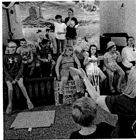
church's VBS. Contact news@unyumc.org with your story.