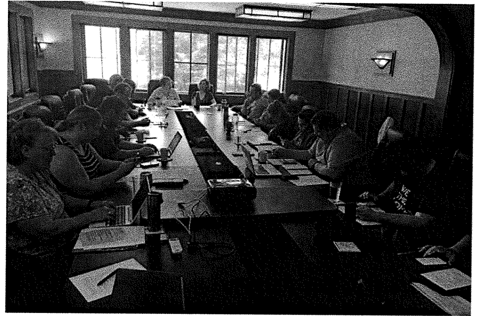
whole Upper New York Conference to join them in praying for the work ahead

The Delegation is going to face many challenges in the coming months, but they plan to hold each other in prayer and support as they work together through all the challenges. They ask the