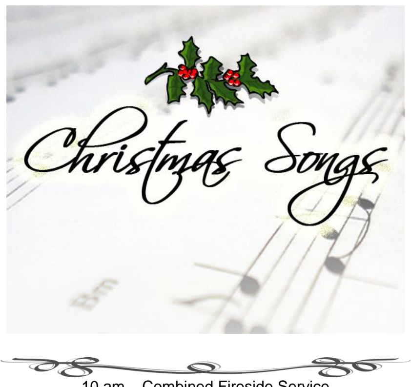
10 am - Combined Fireside Service