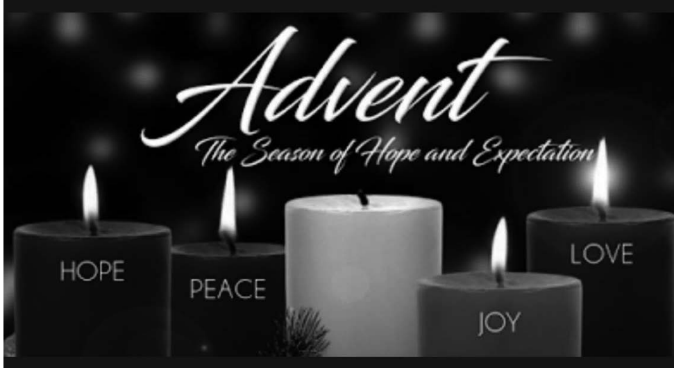
Special Advent issue