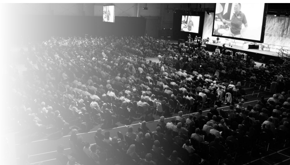
"At every level of the connection, church leaders and members come together in conversation, or conferencing, to discuss important issues and discover God's will for the church." Read more on page 2