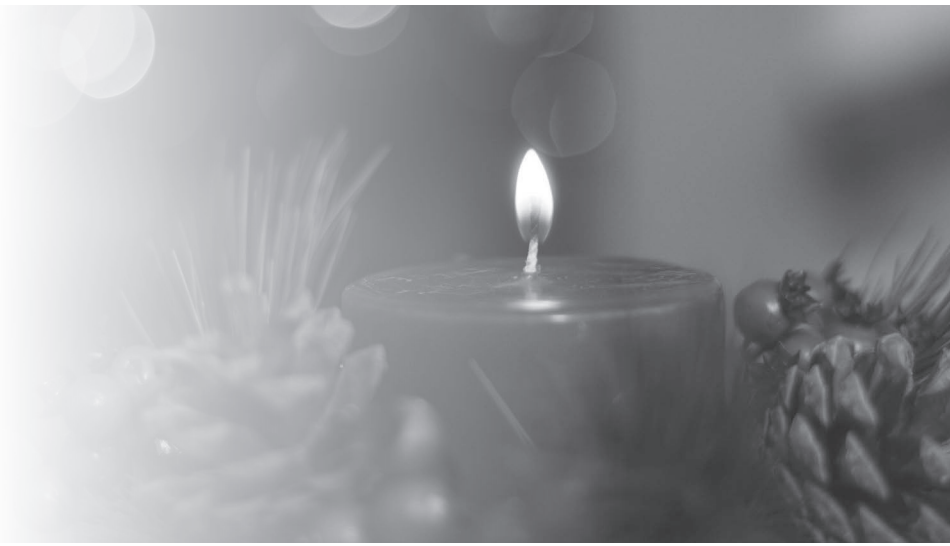
"Christmastime and thoughts of home just go together...."