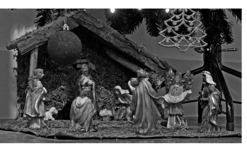
The Bridge is a Conference Communications Ministry tool that delivers to local churches news and stories of ministry from around the Upper New York Conference and the world. For more news and stories visit: www.unyumc.org

Let us gather around the manger. Let us gather around the table of our Lord.